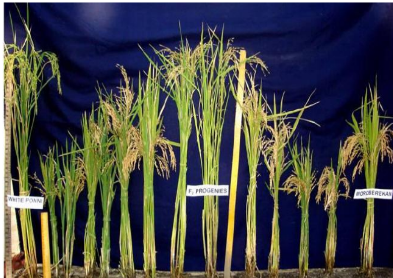
Fig. 2. Variability in the progeny of a cross between two rice varieties. The two parents are at left and right.

Crossing between different but sexually compatible species is mainly used to transfer one or more favourable traits from the donor species, usually a wild relative, to a cultivated one. However, crossing not only transfers the alleles of interest, but it combines all parental genes. To have a stably improved variety for the desired traits, breeders must therefore “clean” the new plants, by removing all the unwanted alleles that have been inherited together with the desired ones, especially when the donor plant is a wild relative. To this purpose, a series of consecutive backcrosses with the original cultivated parent is performed. The final result will be a plant almost identical to the original cultivated parent, but with tens or even hundreds of genes from the wild donor. These will include those responsible for the desired new traits, which will be acquired by the new plant while retaining all or most of the original beneficial traits of the cultivated parent. This process, known as “introgression by backcrossing”, is widely used in breeding to introduce, for example, disease resistance from wild relatives.