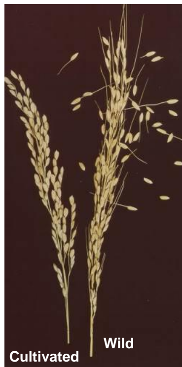
Fig. 1. Cultivated and wild rice

The domestication syndrome consists therefore in the stacking of DNA mutations that alter the expression of specific genes or the function of their products. It follows that all cultivated plants are genetically modified organisms when compared to their wild relatives, and that these modifications are inherent to agriculture. It does not make sense to judge genetic modifications as dangerous or inherently negative per se : instead, the characteristics of the resulting plant should be considered.